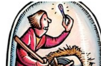
Finding Gems Among Market Laggards