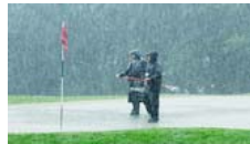
The U.S. Open's Giant Water Hazard