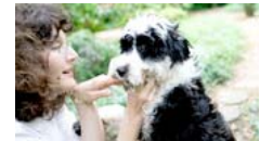
First Pup Unleashes Demand for Water Dogs